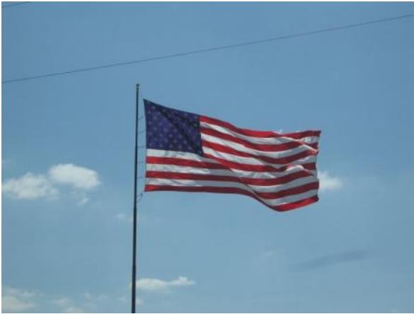
Welcome to USA