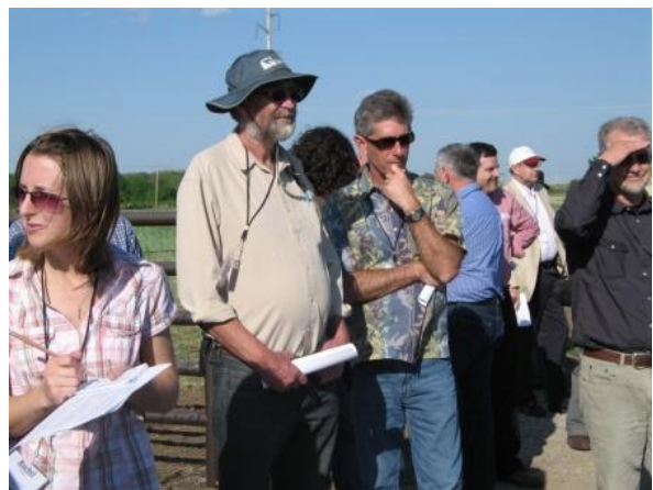
Field tour at The Samuel Roberts Noble Foundation