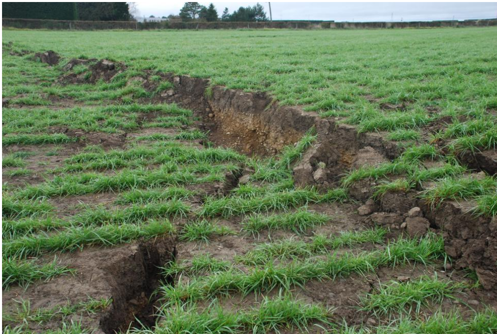
Tall fescue seed field on the new fault line 20 km west of Lincoln