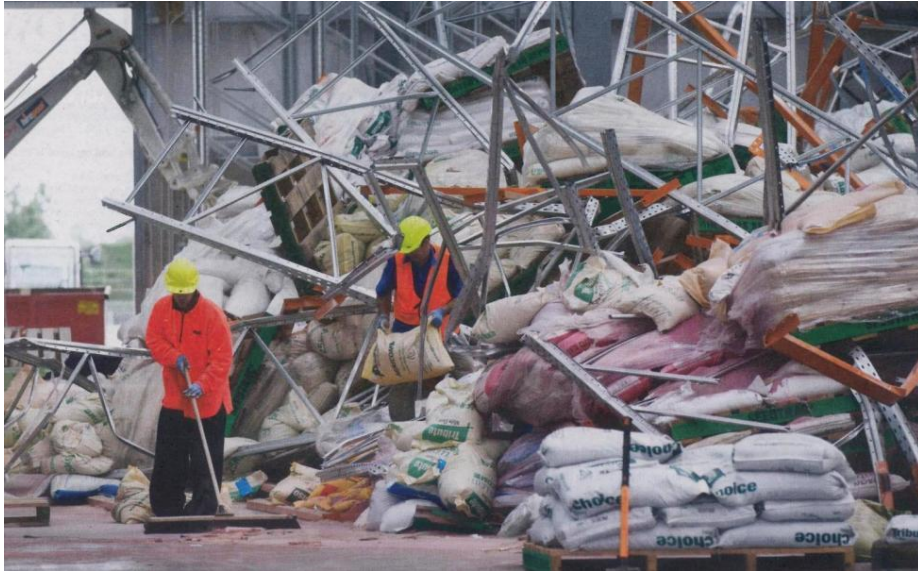
Seed store shattered by the earthquake