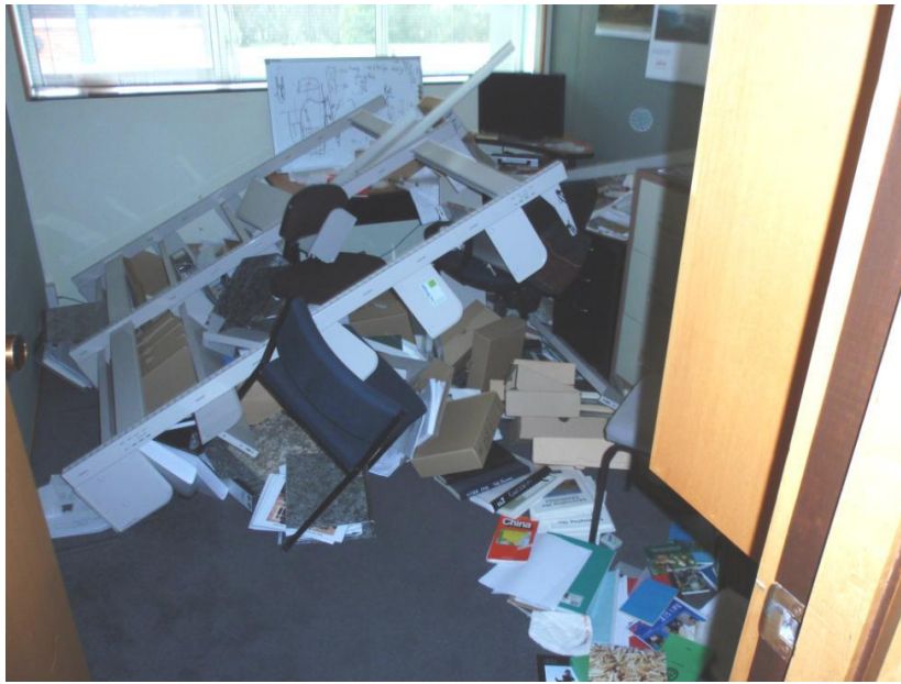
Phil Rolston's office after the earthquake

Farmers also suffered widespread damage with over 50 silos falling, fences and irrigation systems damaged and land disturbance. Thankfully no lives were lost as a result of the earthquake.