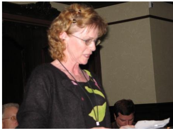
Thank you everybody