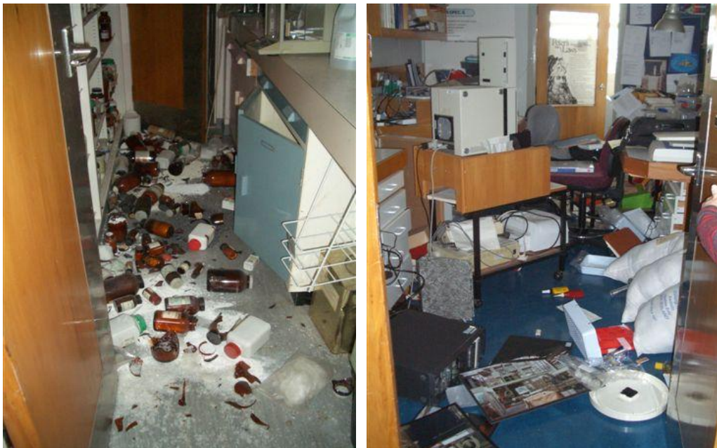
Research laboratories following earthquake