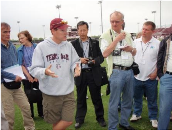
Turf-specialist Texas A&M