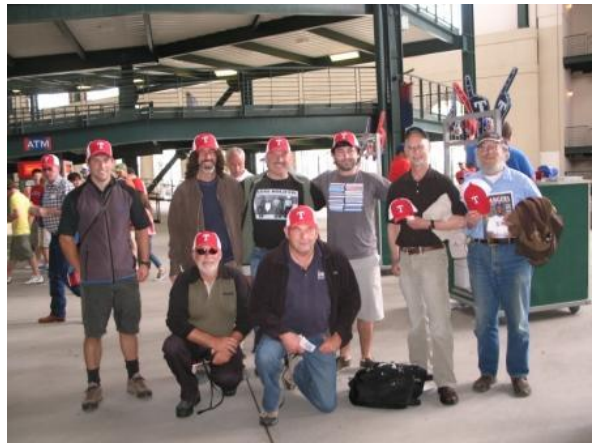
Supporting Texas Rangers