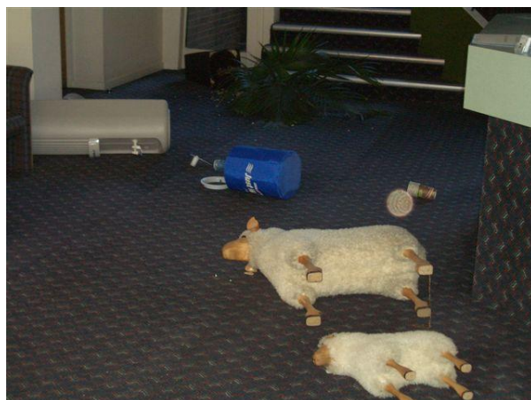
Even the sheep at reception succumbed to the earthquake